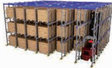
AR DRIVE IN