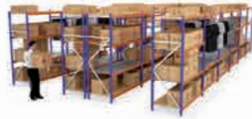
AR LS (LONGSPAN)